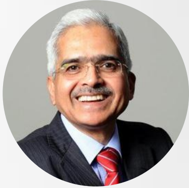
Mr. Shaktikanta Das

Secretary - Department Of Economic Affairs Ministry of Finance, Government of India